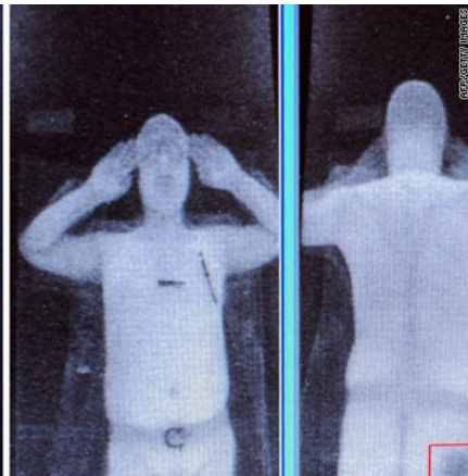
A new body scanner is tested by an employee of Manchester Airport, UK.

on Christmas Day, new security measures are in place, not only in the United States, but worldwide. Causing much controversy, the body scanner is the most recent form of airline security. In order for the body scanner to work efficiently, an individual steps into a booth while being scanned. The process is similar to an x-ray. Much controversy regarding the scanners is